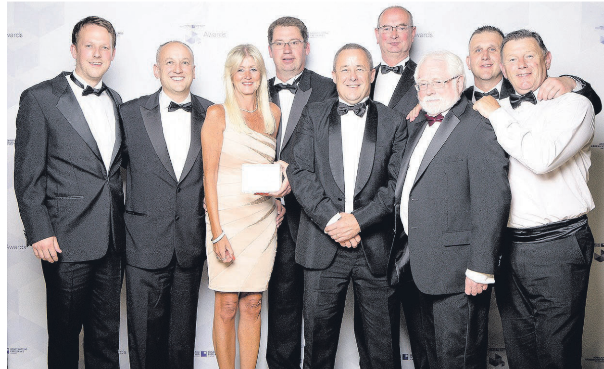
Value Award – which went to the Ysbryd y Coed – Elderly Intermediate Care Unit – with Interserve Construction Ltd, Interserve Consulting, Boyes Rees, Lee Wakemans, F P Hurley Ltd, Julian James Cladding Ltd and their client Abertawe Bro Morgannwg University Health Board