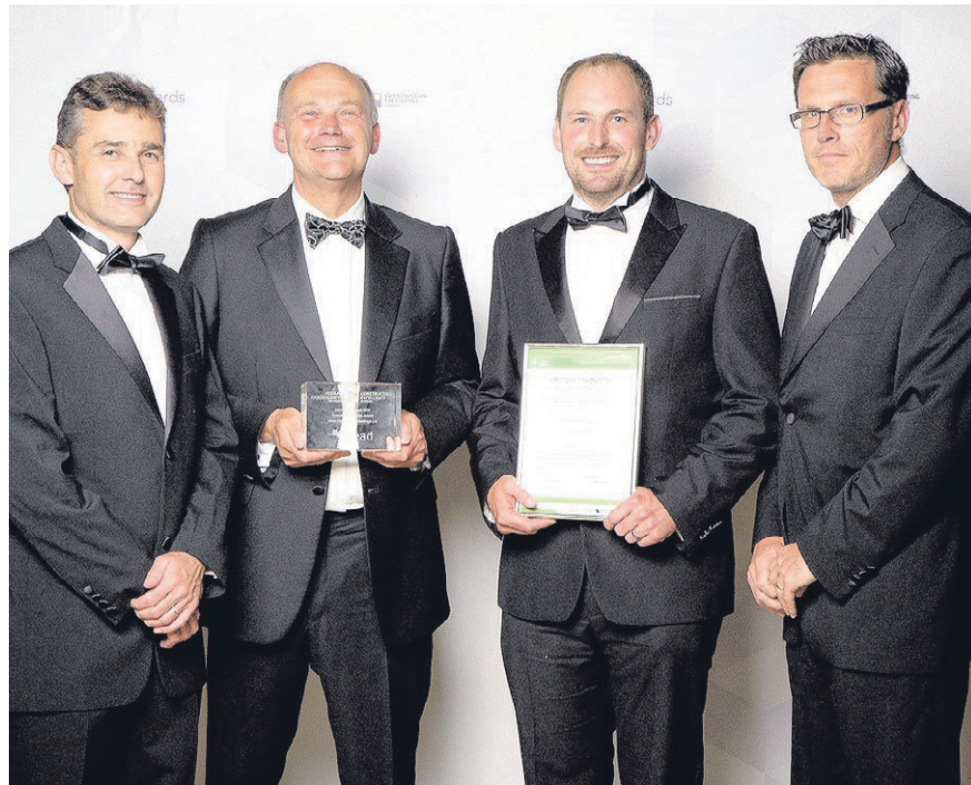
Innovation Award – Special Recognition Award went to Read Construction Holdings Ltd, Capita Symmonds, Lovelock Mitchell Architects, Margden Heating – the client was Flintshire County Council

Telephone: 029 2049 3322 info@cewales.org.uk