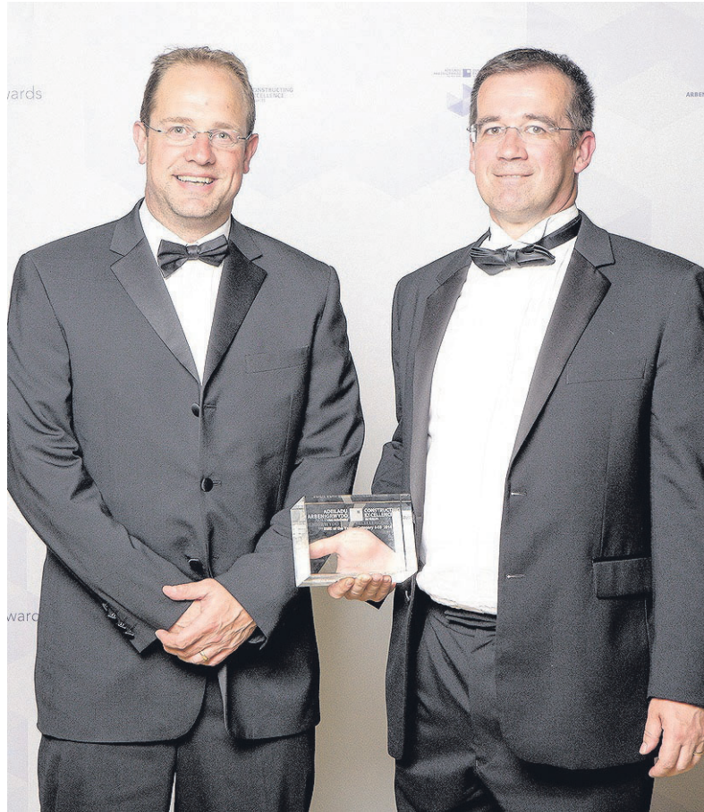
Provelio Ltd, winners of SME of the Year for firms of one-50 employees