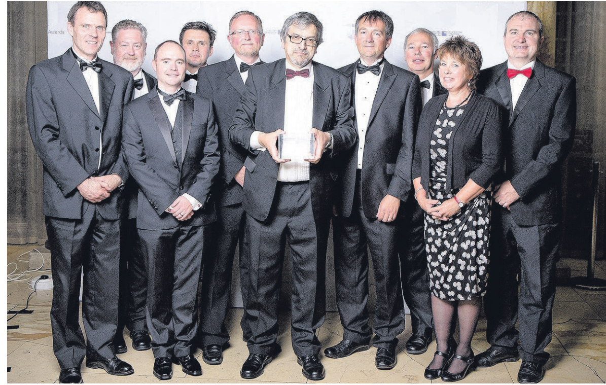
Integration & Collaborative Working Award – received by representatives of SRB Civil Engineering UK Ltd, Ramboll UK, Hyder Consulting, Hydro Industries and their client Welsh Government Transport