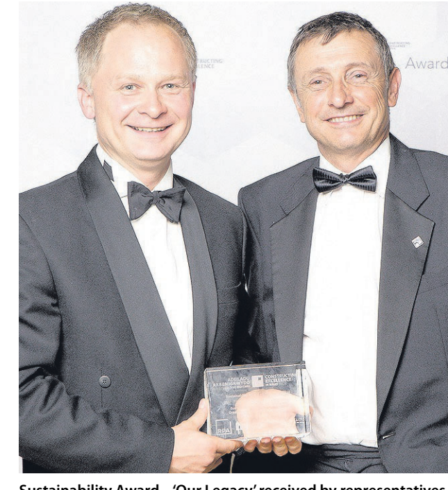
Sustainability Award – 'Our Legacy' received by representatives of Sustainable Housing Development: Great House Farm – LivEco & Gillard Associates Ltd, Stewart Consulting, RPA