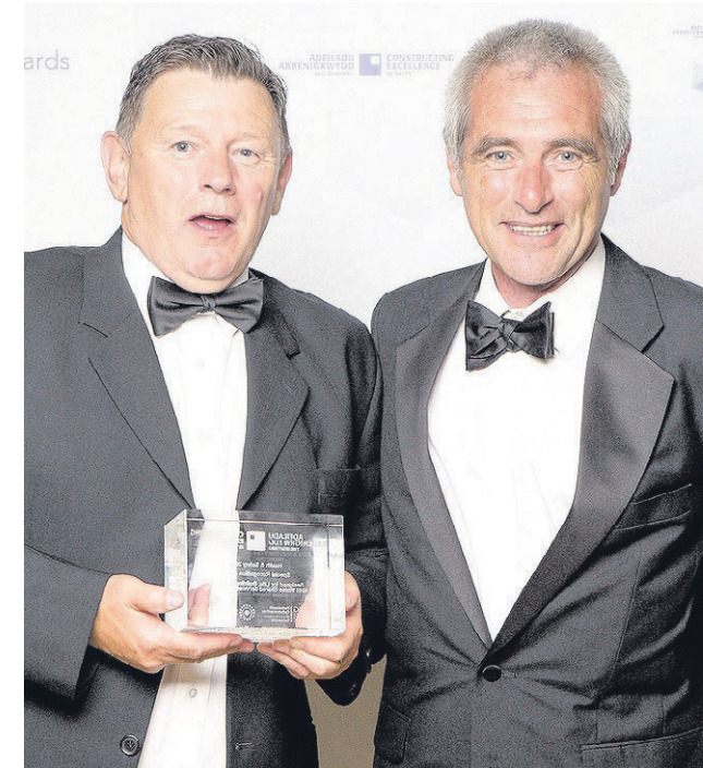
Representatives of Designed For Life: Building for Wales – NHS Shared Services Partnership