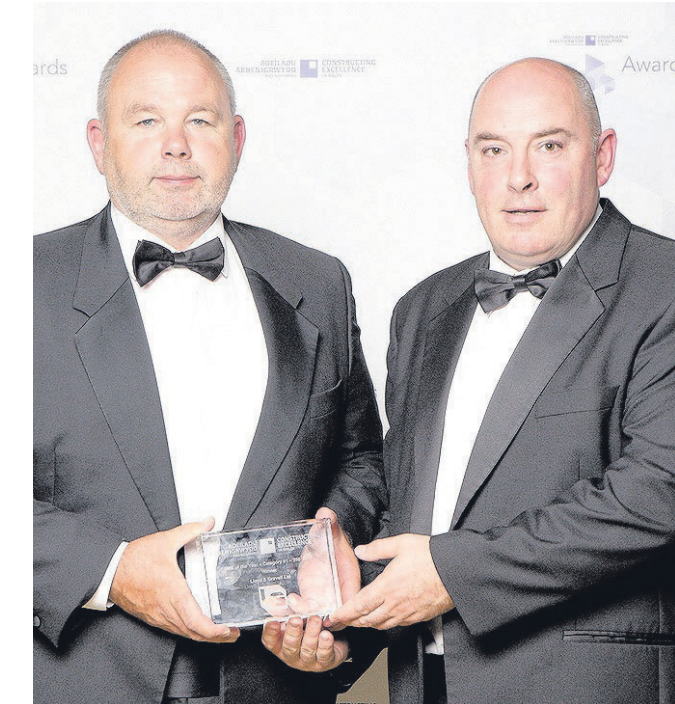
SME of the Year for organisations up to 250 employees won by Lloyd & Gravell Ltd