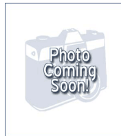
Assistant Solicitor June 2017