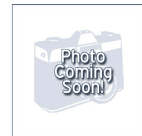
Senior Associate July 2017