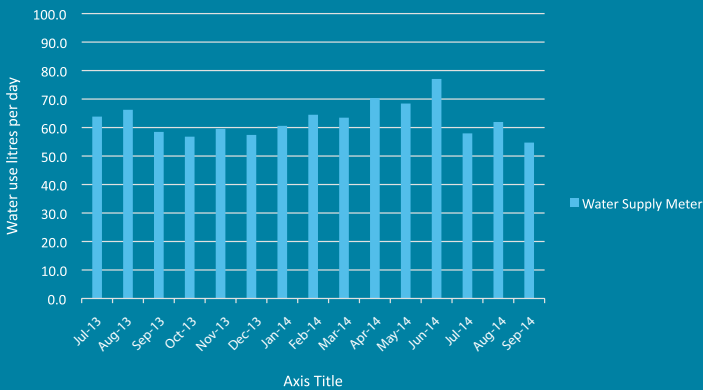
Maes Yr Onn water use litres per day per person

Regulations & planning: A development of this nature was setting a precedent and tested the authority's planning policies and regulations. The project also provided an exciting opportunity to learn more about renewable energy, water technologies and low carbon building design with a fabric first approach.